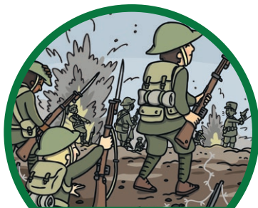
Battle of the Somme