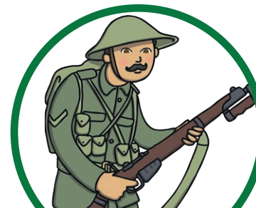
First World War soldier